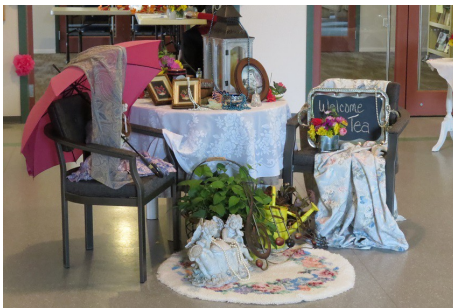
High Tea Display

Memorabilia, pearls, lace, flowers and fine china surrounded our members at the September 22nd 'Welcome Back Fall Tea'.