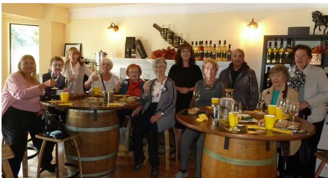
Members of the Art Appreciation Group enjoying the visit.