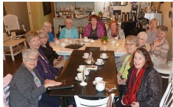
CFUW members from many of the BC clubs participating in one of the several tours featured at the Conference – This tour took us to the Reach Art Gallery Museum in Abbotsford and then to a quaint restaurant and bakery where we shared our adventures over a cup of tea and goodies.