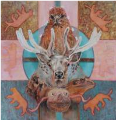
"Totem: From the Boreal"