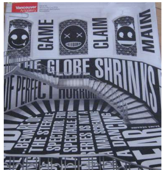
VAG Staircase ready for the MASHUP Exhibition

MASHUP is a large show and needs to be viewed in at least two sessions with a lunch break in between.