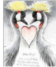
One of the many Valentine's Day Cards