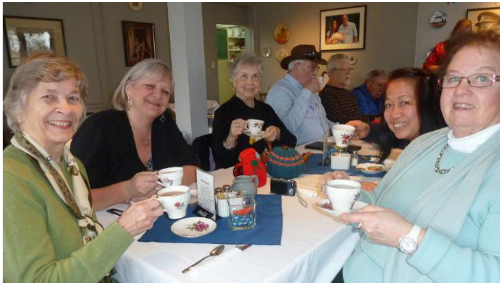
Members of the Art Appreciation Group and guests enjoying High Tea

Before departing to catch the ferry home, we enjoyed High Tea at the James Bay Tea Room. A most enjoyable day and a "must see" stop if you are in Victoria.