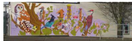
Wild Birds Unlimited Mural