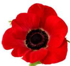
Lest we forget

Volume 18 Number 3 November / December 2017