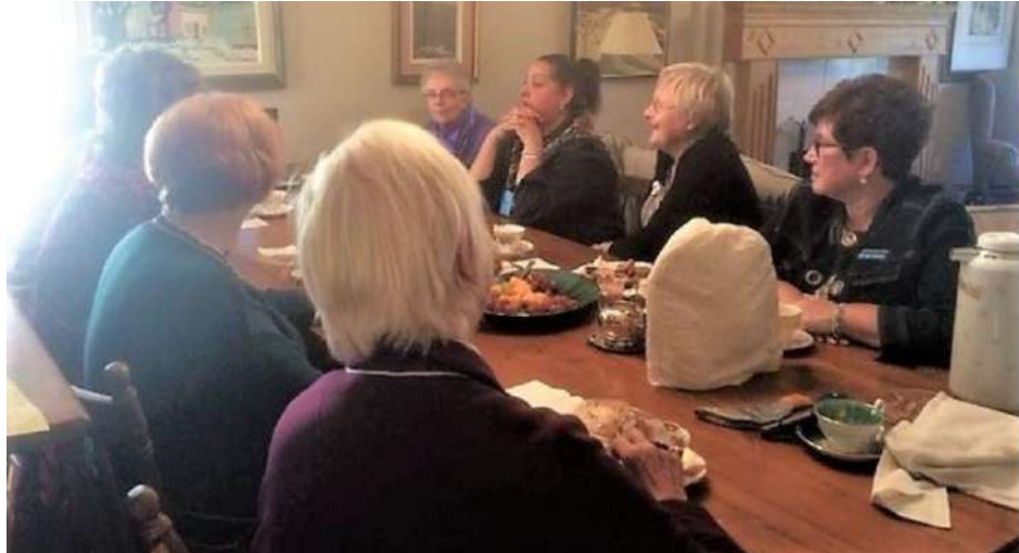
The ladies enjoying goodies and an interesting conversation.