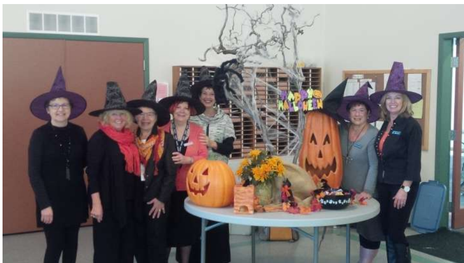
The Witchy Women of the Program Committee