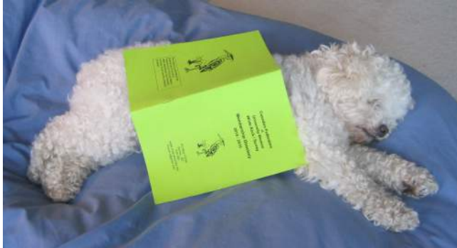
"Alice" takes a well-deserved nap after all the counting.....