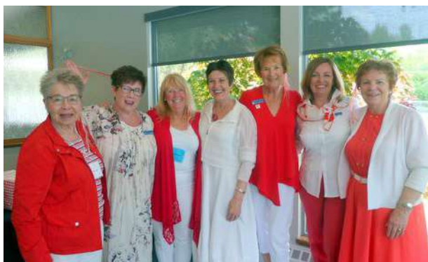
(The Program Committee)