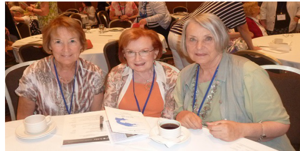
Our three attendees from White Rock/Surrey Club hard at work in a workshop.