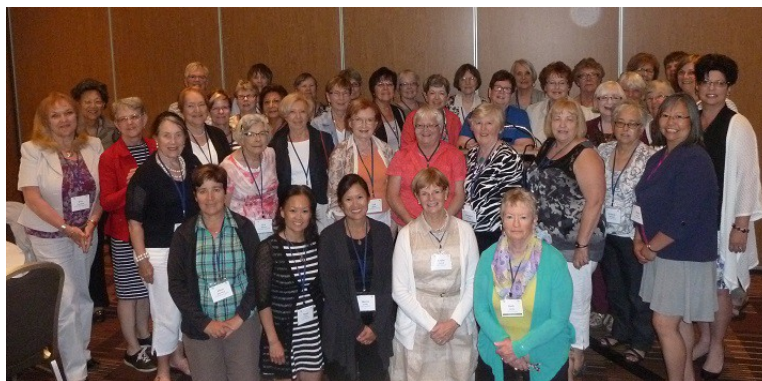
All of the BC attendees following our Regional luncheon (all five regions met at separate luncheons).